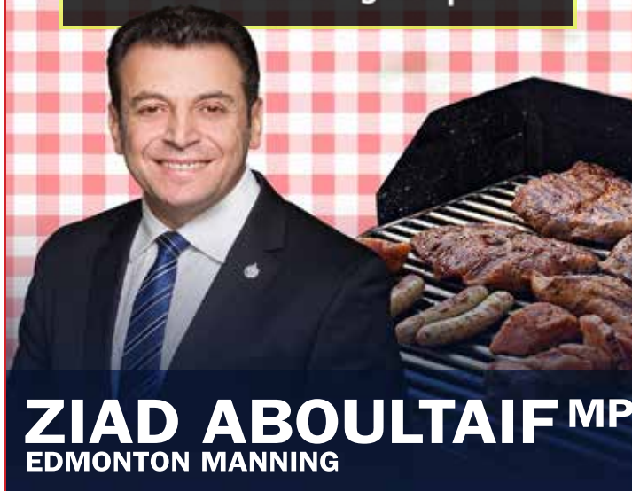
ZIAD ABOULTAIF MP EDMONTON MANNING